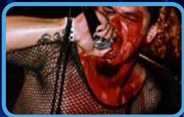
KREATURELAGOTH 1:15 PM