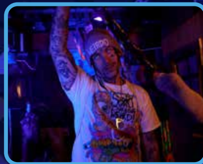
CARTOON BONDURANT 3:00 AM