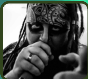
RYSK 12:40 AM