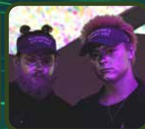
KLOKWERK E 2:40 AM