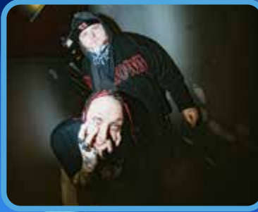
THE UNFORGIVEN 12:45 PM