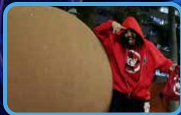
LOONEY'S TUNEZ 2:00 PM