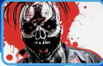
TRAUMA 2$ICK 1:00 PM