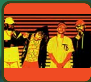
BARS 2:40 AM