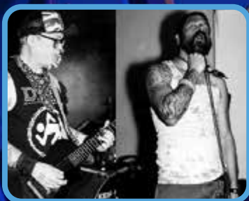
BAZOOKA SHARKZ 3:00 PM