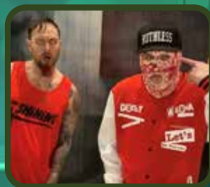
ISOLATED BEINGZ 5:10 PM