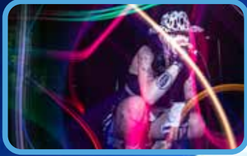
POSEZUR 12:15 PM