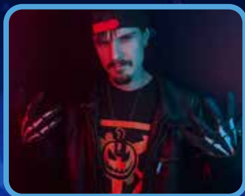
ROOK MEWSICK 2:15 PM