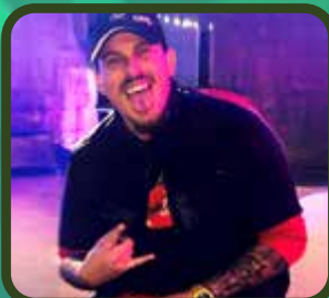
DRAWOL 1:20 AM