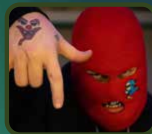
NINJA GOD 5:40 PM

Sailing straight out of the streets of Grove City, OH, to dock for an epic 4-day excursion in The Loon Woods at this year's Gathering of the Juggalos. Shangside has teamed up with Texture Productions and The Ship of Fools to bring in this dope stage for your enjoyment this year. We will be hosting events and musical acts all weekend. How often are you going to find a Pirate Ship Stage in the middle of the woods? Come get your wigs blown back by our musical acts (or the cannon). You do not want to miss these events. Can't wait to see you there, we love you all! We're just out here trying to build a vibe.