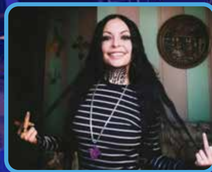
SMALLZ ONE 12:45 AM