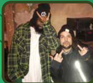
DIRTBOYS 1:20 AM