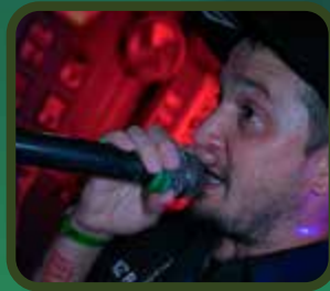
J BIZ R 5:10 PM