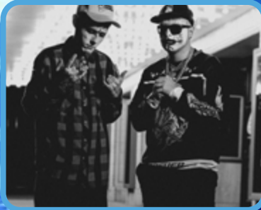
THE LAP 3:15 PM