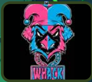
WHACK 4:10 PM