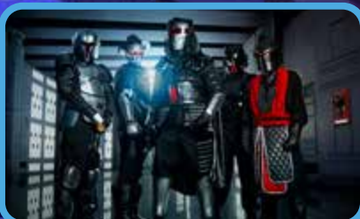
GALACTIC EMPIRE • 1:20 AM