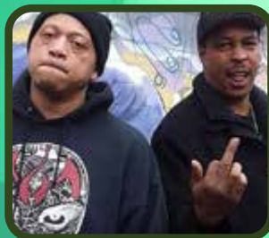
THE BRIMSTONE LAB 4:40 PM