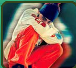
KNG DZL 2:00 AM