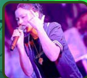
MOLLY GRUESOME 2:40 AM