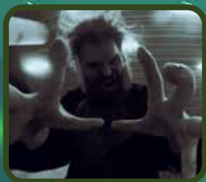
FOR THE ENEMY 4:10 PM