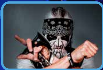
KING WICKED 3:30 PM