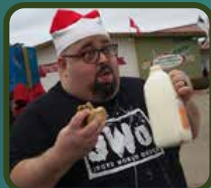
BIG SHERM MIDNIGHT