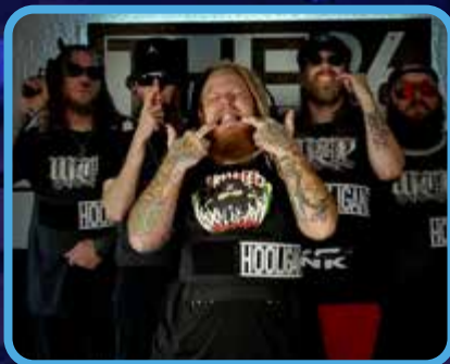
THE HOOLIGANZ 2:15 AM