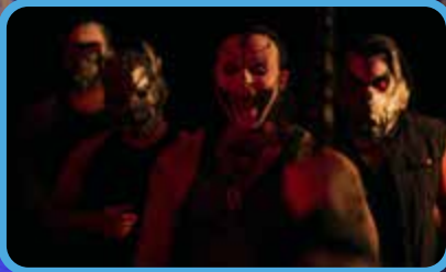
MONSTER WOLF • 12:20 AM

Ummo is a rap-metal and horrorcore band, although the term they best identify with is "sci-fi rap" - a genre they invented themselves. The origin of the name Ummo comes from the 1960s, when an alleged UFO encounter took place in Madrid. It is said that the Ummites, who are the inhabitants of the planet Ummo, located in the Wolf 424 star system, had several communications with the earthlings with the intention of carrying out a peaceful mission on our planet, and that they even came and live among us! Behold the band that traveled nearly 14.4 light years to perform at the annual spectacle known as the Gathering of the Juggalos!