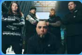
SAINT DIABLO 2:30 PM