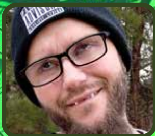
HEARSEBOI 4:10 PM