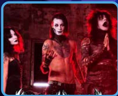
BIBLE BELT MASSACRE 11:15 PM