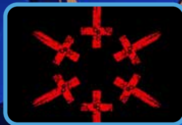
CORVIN'S BREED 4:15 PM