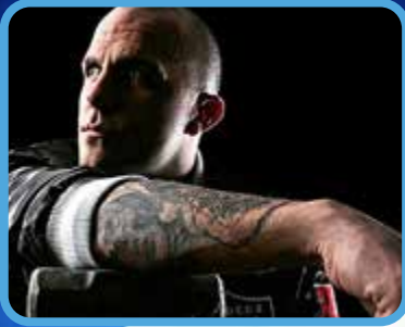
WILDCARD 12:00 PM