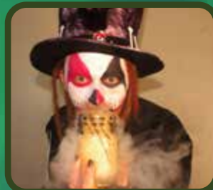
BAMBAM THE VOODOO CHILD 2:00 AM