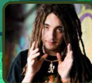
APOLLO EXODUS 2:00 AM