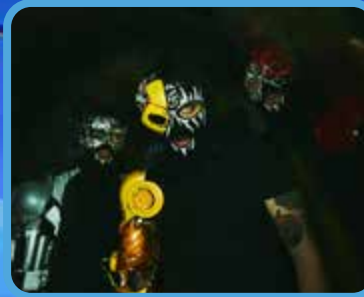
UMMO 4:00 PM