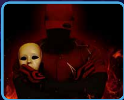
V-SINIZER 1:30 AM