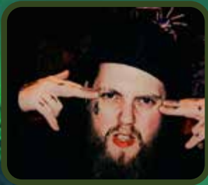
BAKE LO 4:40 PM