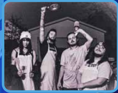
XEIGHTY-SIXEDx 1:30 PM