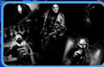
SHOWMEGOD 2:45 PM