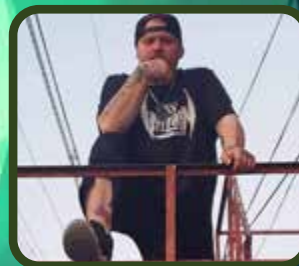
JAY VILLAIN 5:40 PM