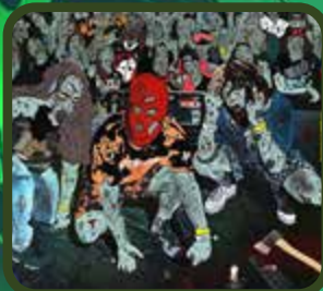
WORLDWIDE CHAOS 12:40 AM