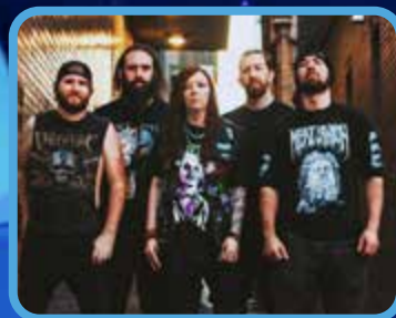
DYING OATH 4:30 PM