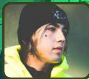
GREYKEYES 5:40 PM