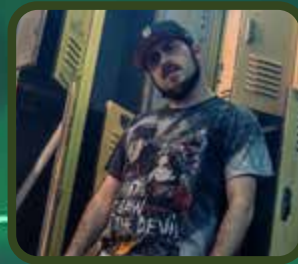
ENOKH XMORTIZ 5:40 PM