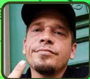
NUCLEAR DYSFUNCTION 4:40 PM