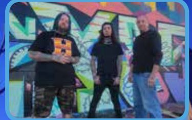
SCREAM AT THE SKY 4:00 PM