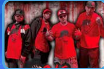
OUR INNER CIRCLE 3:15 PM